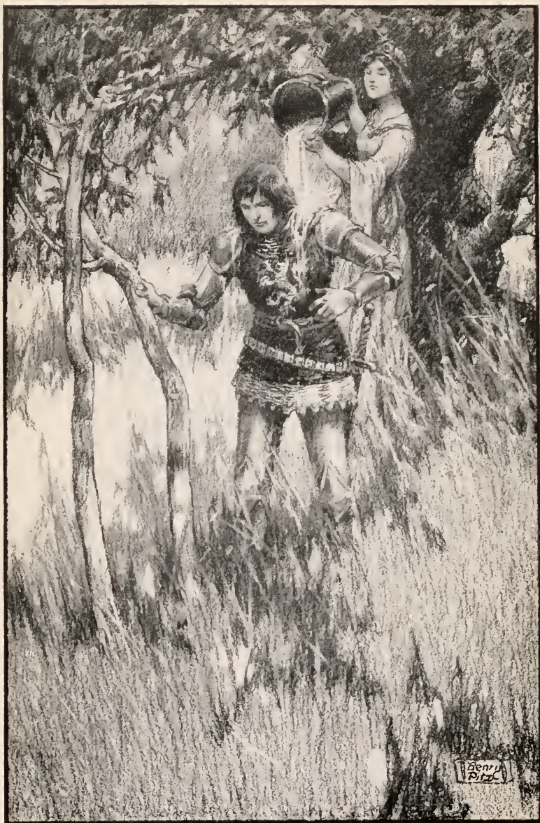
I DRANK AND THEN STOOD UP, AND SHE POURED THE REST DOWN INSIDE THE ARMOR